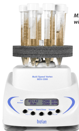
MSV-3500 with platform SV-8/15