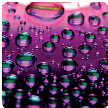
the minispec Droplet Size Analysis