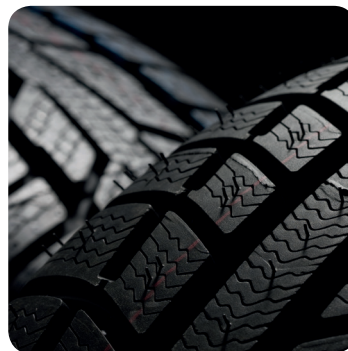
the minispec Cross Link Density Analysis