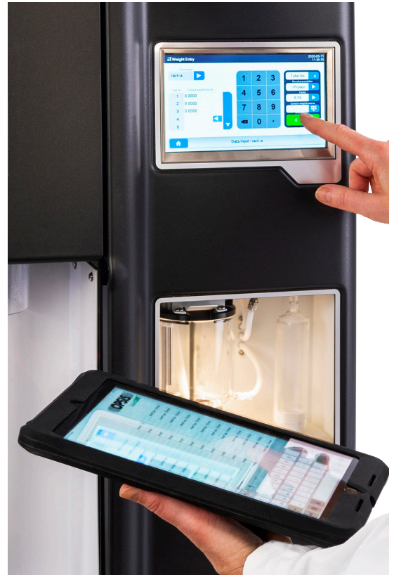
THE LABCONNECT SOFTWARE ALLOWS FOR EASY CONNECTIVITY TO YOUR LABORATORY