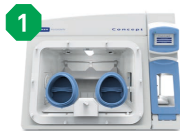
Concept 400 Perfect for mid-range anaerobic workloads

There are four models in the Concept range, each one carefully refined to suit your specific needs, with advanced ergonomic design providing excellent hand access and rapid plate loading. Ideal for varying capacity workloads and providing the best primary isolation rates for your anaerobic and microaerophilic cultures.