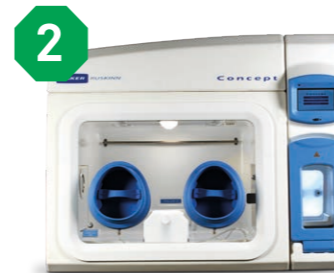
Concept 400-M Perfect for mid-range anaerobic or microaerophilic workloads