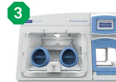
Concept 500 Perfect for mid-range workloads, with larger interlock