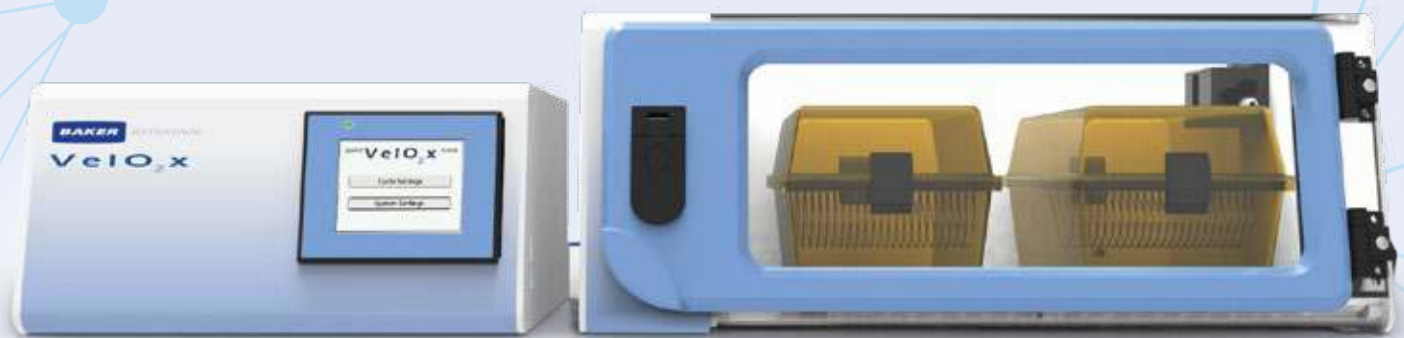
Fast O 2 ramping and fluctuation over 8-10 hours