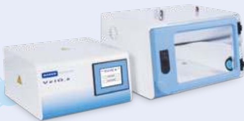
VELO 2 x 66L ANIMAL MODELING CHAMBER