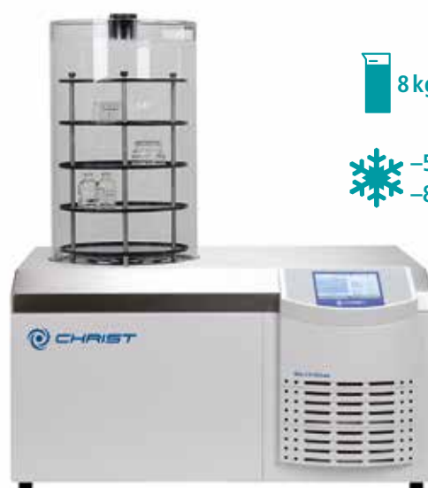
Alpha 3-4 LSCbasic