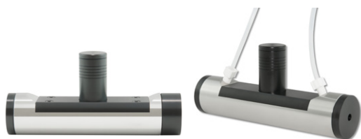
New polarimeter tubes

The new design has nearly half the size of our earlier models packed with new features and highly integrated hardware. The experience of over more than 150 years in polarimetry is reflected in all components like AWC, the fortified Aluminum core, the built in quality indicator of samples as well as the check of calibration standards. The 100mm sample room is optimal for the needs of pharmaceutical and chemical laboratories.